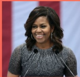
Michelle Obama Former First Lady of the United States

Success isn't about how much money you make; it's about the difference you make in people's lives.